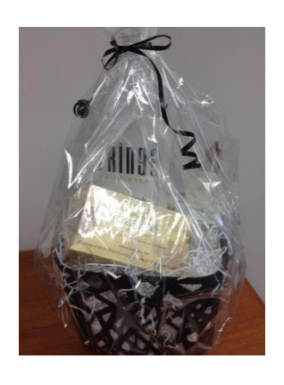
Gift Basket Donated by: The Source Value: $50